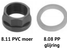
8.11 PVC moer